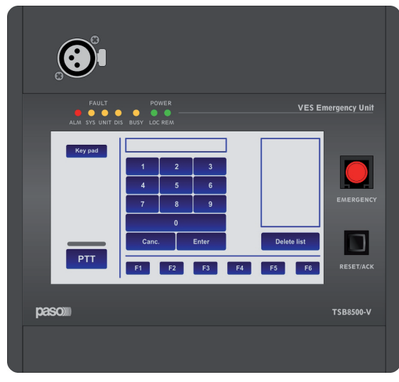
"Numeric pad" mode