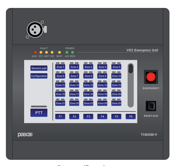
"Key pad" mode