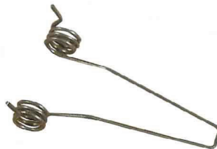
BRACKET HOLDER (Enclosed)