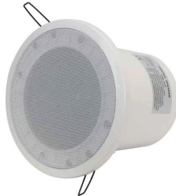
CSL-407 / CSL-410